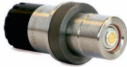
Orbisphere A1100 Amperometric Dissolved Oxygen Sensor