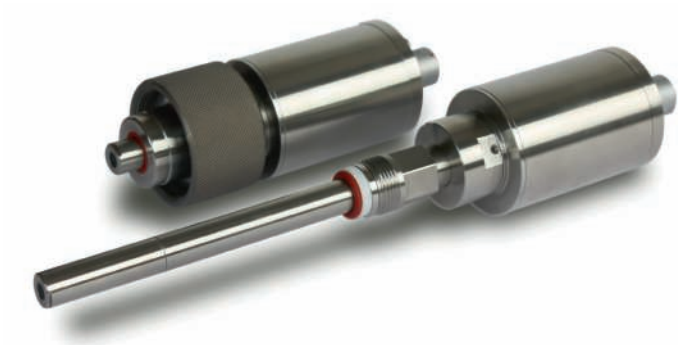
Orbisphere M1100 Optical Dissolved Oxygen Sensor